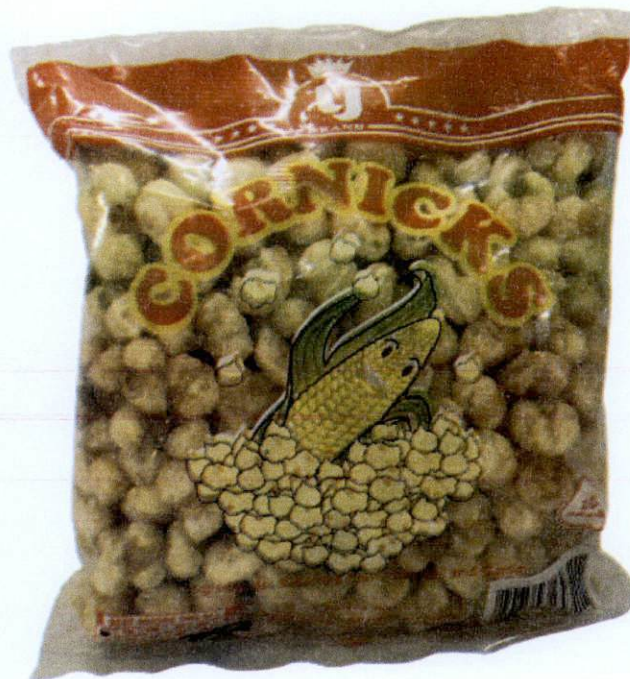
Figure 1. Unregistered TJ BRAND Cornicks

The Food and Drug Administration (FDA) warns all healthcare professionals and the general public NOT TO PURCHASE AND CONSUME the unregistered food product: