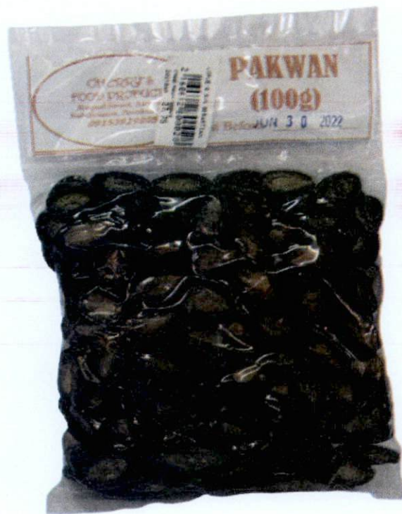
Figure 1. Unregistered CHERRY'S FOOD PRODUCTS Pakwan

The Food and Drug Administration (FDA) warns all healthcare professionals and the general public NOT TO PURCHASE AND CONSUME the unregistered food product: