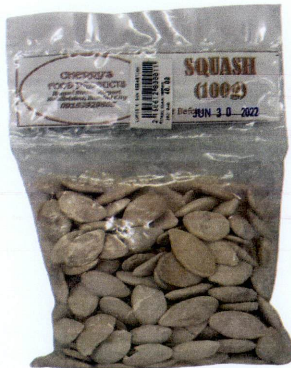
Figure 1. Unregistered CHERRY'S FOOD PRODUCTS Squash

The Food and Drug Administration (FDA) warns all healthcare professionals and the general public NOT TO PURCHASE AND CONSUME the unregistered food product: