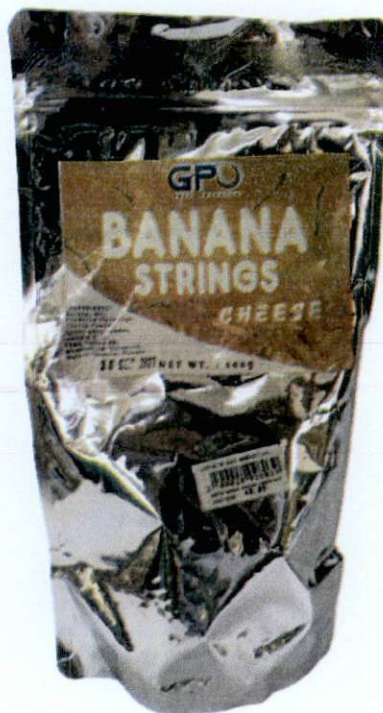
Figure 1. Unregistered GPO FOOD PRODUCTS Banana Strings Cheese

The Food and Drug Administration (FDA) warns all healthcare professionals and the general public NOT TO PURCHASE AND CONSUME the unregistered food product: