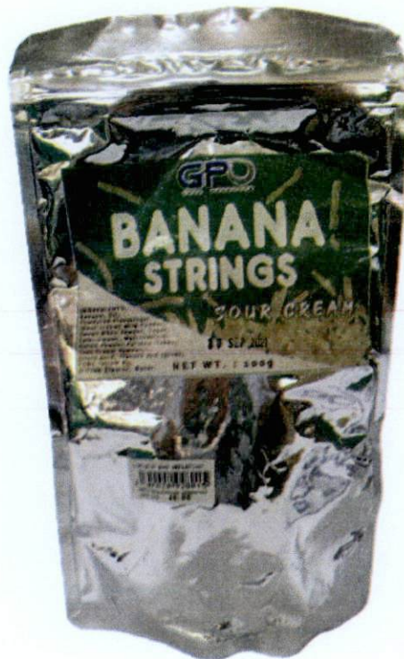
Figure 1. Unregistered GPO FOOD PRODUCTS Banana Strings Sour Cream

The Food and Drug Administration (FDA) warns all healthcare professionals and the general public NOT TO PURCHASE AND CONSUME the unregistered food product: