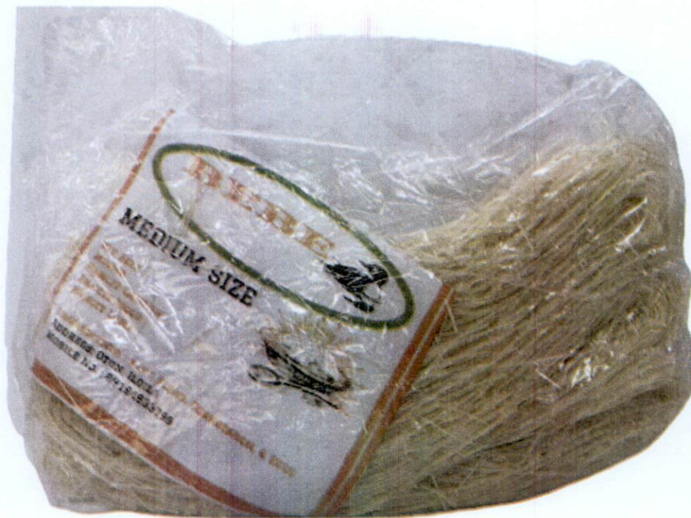
Figure 1. Unregistered BEBE Misua Medium Size

The Food and Drug Administration (FDA) warns all healthcare professionals and the general public NOT TO PURCHASE AND CONSUME the unregistered food product: