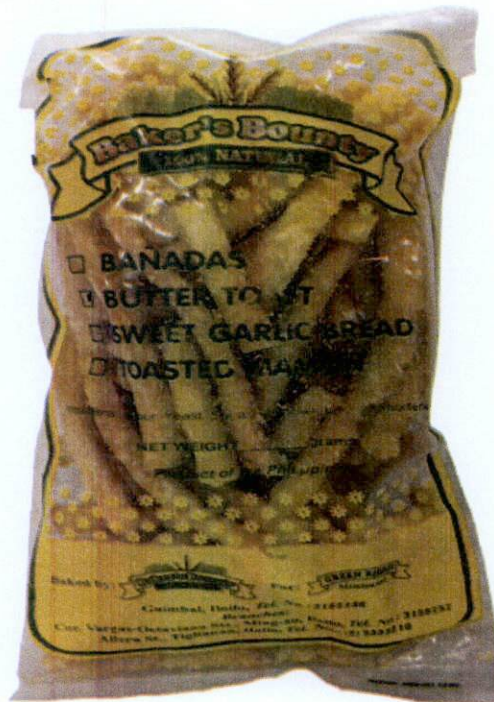
Figure 1. Unregistered BAKER'S BOUNTY Butter Toast

The Food and Drug Administration (FDA) warns all healthcare professionals and the general public NOT TO PURCHASE AND CONSUME the unregistered food product: