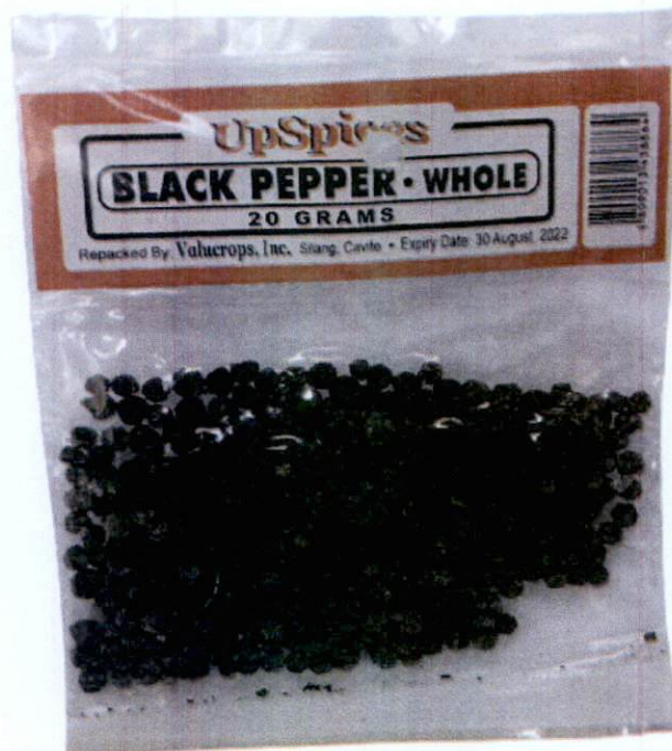
Figure 1. Unregistered UPSPICES Black Pepper Whole

The Food and Drug Administration (FDA) warns all healthcare professionals and the general public NOT TO PURCHASE AND CONSUME the unregistered food product: