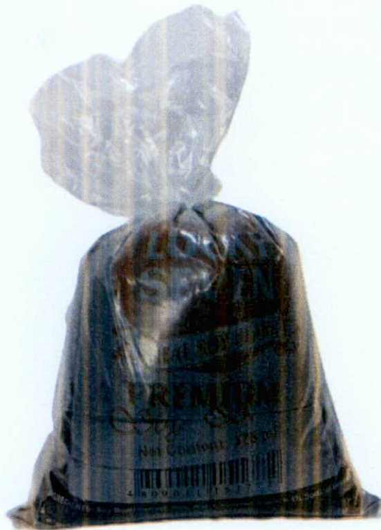
Figure 1. Unregistered LUCKY SEVEN Real Soy Beans Premium

The Food and Drug Administration (FDA) warns all healthcare professionals and the general public NOT TO PURCHASE AND CONSUME the unregistered food product: