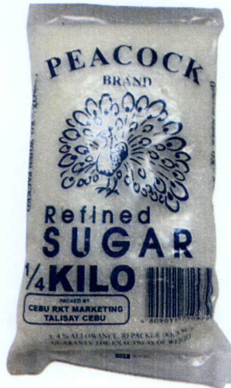
Figure 1. Unregistered PEACOCK BRAND Refined Sugar

The Food and Drug Administration (FDA) warns all healthcare professionals and the general public NOT TO PURCHASE AND CONSUME the unregistered food product: