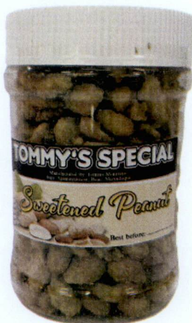
Figure 1. Unregistered TOMMY'S SPECIAL Sweetened Peanut

The Food and Drug Administration (FDA) warns all healthcare professionals and the general public NOT TO PURCHASE AND CONSUME the unregistered food product: