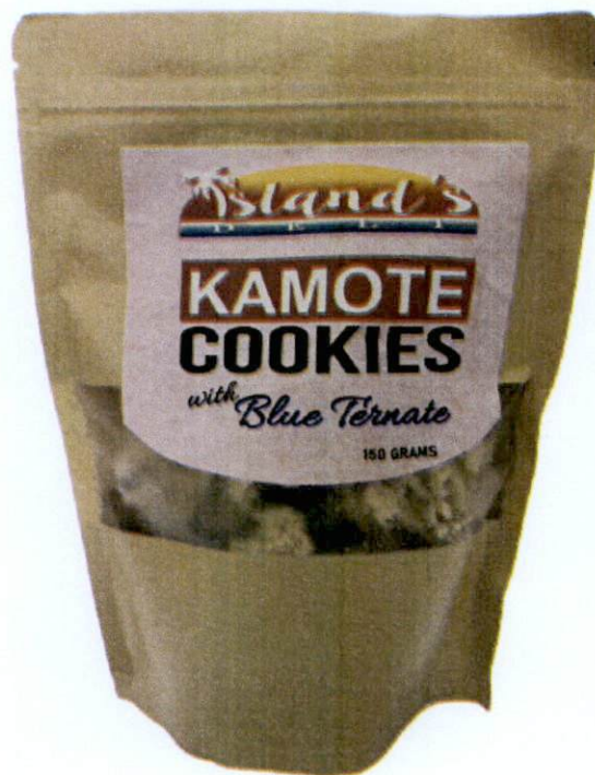
Figure 1. Unregistered ISLAND'S DELI Kamote Cookies with Blue Ternate

The Food and Drug Administration (FDA) warns all healthcare professionals and the general public NOT TO PURCHASE AND CONSUME the unregistered food product: