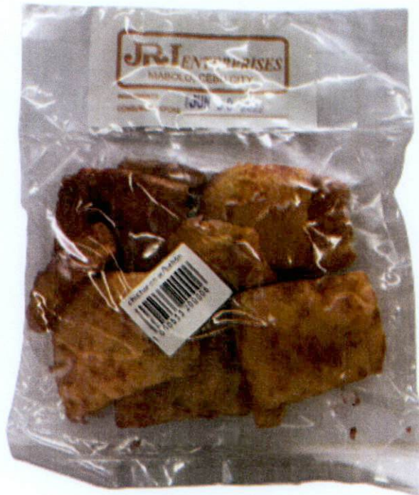
Figure 1. Unregistered JRJ ENTERPRISES Chicharon w/ Behon

The Food and Drug Administration (FDA) warns all healthcare professionals and the general public NOT TO PURCHASE AND CONSUME the unregistered food product: