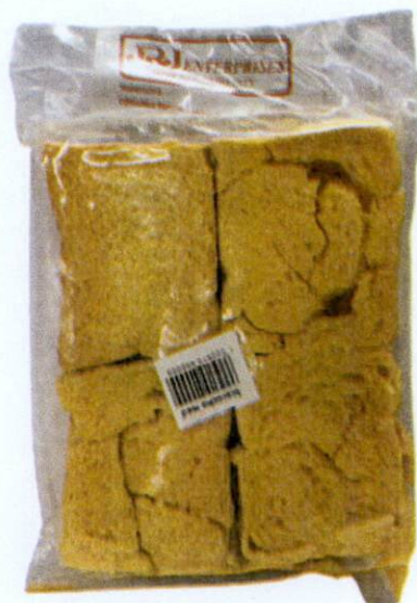
Figure 1. Unregistered JRJ ENTERPRISES Biscocho Med

The Food and Drug Administration (FDA) warns all healthcare professionals and the general public NOT TO PURCHASE AND CONSUME the unregistered food product: