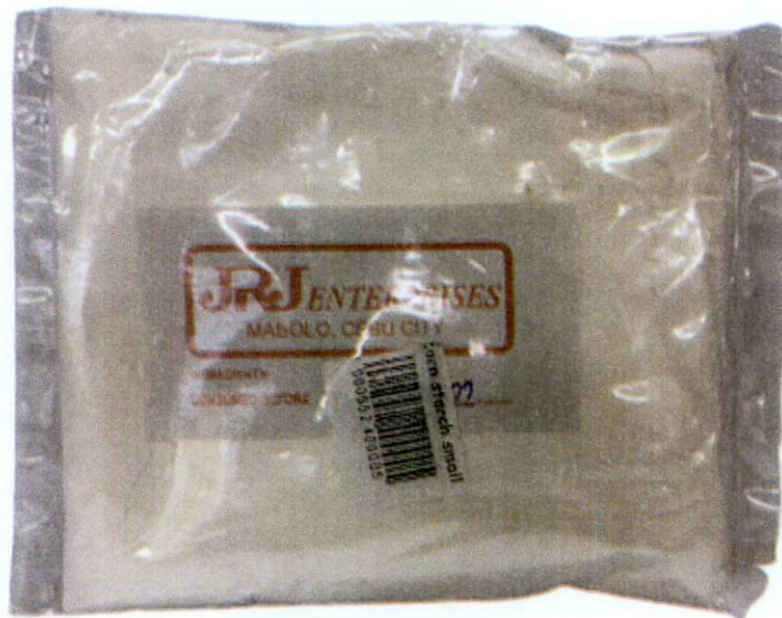
Figure 1. Unregistered JRJ ENTERPRISES Corn Starch Small

The Food and Drug Administration (FDA) warns all healthcare professionals and the general public NOT TO PURCHASE AND CONSUME the unregistered food product: