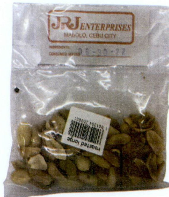
Figure 1. Unregistered JRJ ENTERPRISES Roasted Large (Peanut)

The Food and Drug Administration (FDA) warns all healthcare professionals and the general public NOT TO PURCHASE AND CONSUME the unregistered food product: