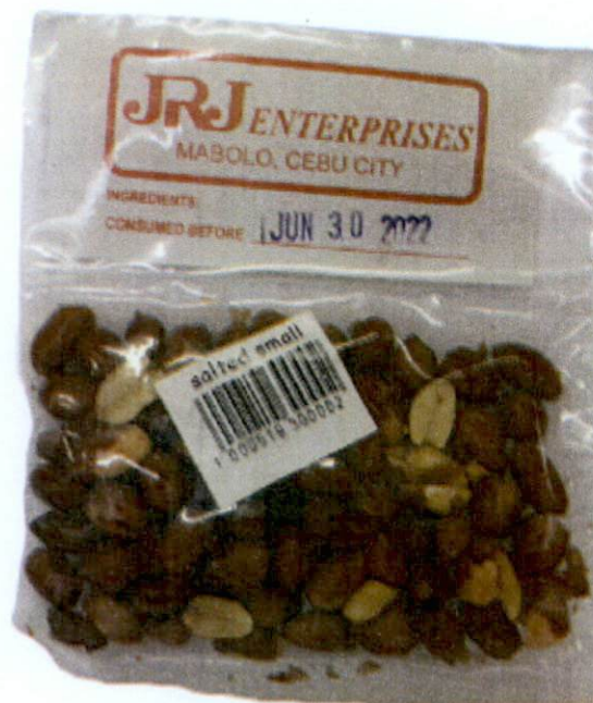
Figure 1. Unregistered JRJ ENTERPRISES Salted Small (Peanut)

The Food and Drug Administration (FDA) warns all healthcare professionals and the general public NOT TO PURCHASE AND CONSUME the unregistered food product: