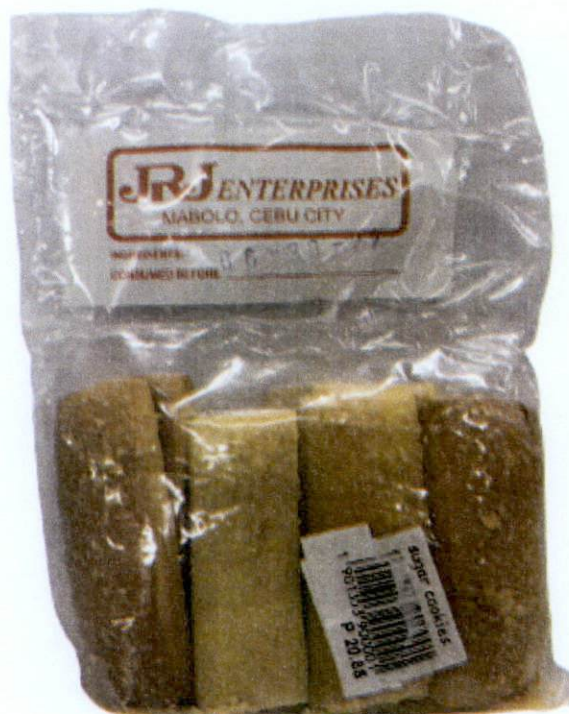
Figure 1. Unregistered JRJ ENTERPRISES Sugar Cookies

The Food and Drug Administration (FDA) warns all healthcare professionals and the general public NOT TO PURCHASE AND CONSUME the unregistered food product: