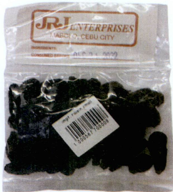
Figure 1. Unregistered JRJ ENTERPRISES Impt. Raisin Small

The Food and Drug Administration (FDA) warns all healthcare professionals and the general public NOT TO PURCHASE AND CONSUME the unregistered food product: