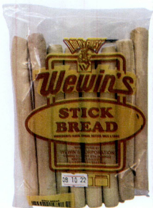
Figure 1. Unregistered WEWIN'S Stick Bread

The Food and Drug Administration (FDA) warns all healthcare professionals and the general public NOT TO PURCHASE AND CONSUME the unregistered food product: