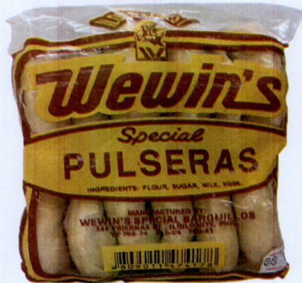
Figure 1. Unregistered WEWIN'S Special Pulseras

The Food and Drug Administration (FDA) warns all healthcare professionals and the general public NOT TO PURCHASE AND CONSUME the unregistered food product: