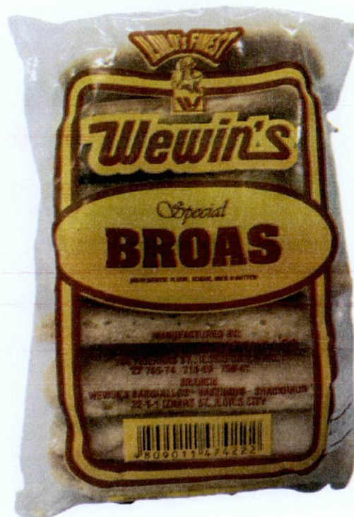
Figure 1. Unregistered WEWIN'S Special Broas

The Food and Drug Administration (FDA) warns all healthcare professionals and the general public NOT TO PURCHASE AND CONSUME the unregistered food product: