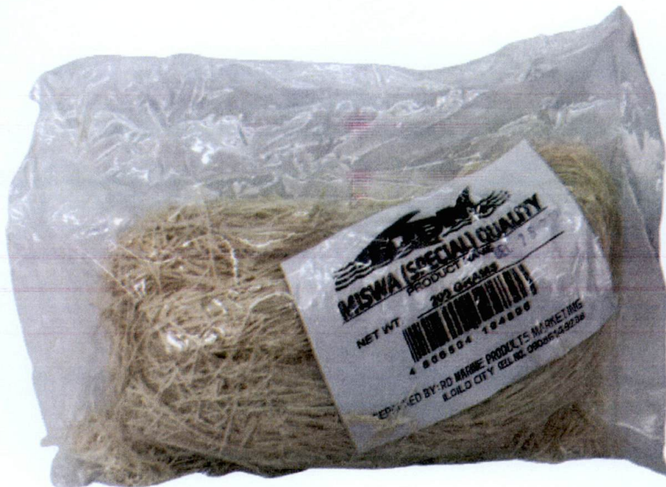
Figure 1. Unregistered RDM Miswa (Special) Quality

The Food and Drug Administration (FDA) warns all healthcare professionals and the general public NOT TO PURCHASE AND CONSUME the unregistered food product: