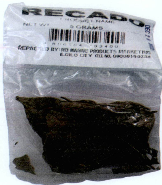
Figure 1. Unregistered RDM Recado (Laurel Leaves)

The Food and Drug Administration (FDA) warns all healthcare professionals and the general public NOT TO PURCHASE AND CONSUME the unregistered food product: