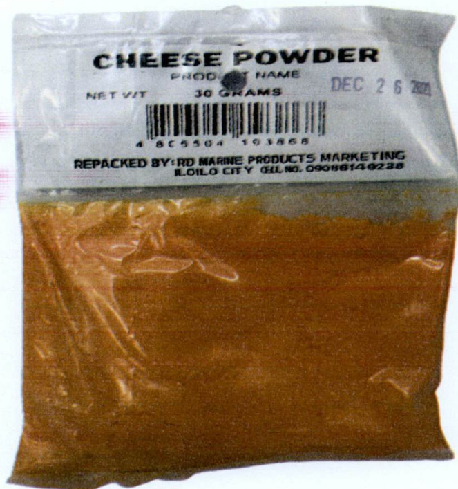
Figure 1. Unregistered RDM Cheese Powder

The Food and Drug Administration (FDA) warns all healthcare professionals and the general public NOT TO PURCHASE AND CONSUME the unregistered food product: