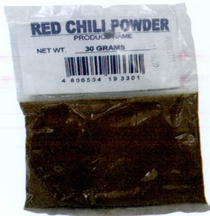
Figure 1. Unregistered RDM Red Chili Powder

The Food and Drug Administration (FDA) warns all healthcare professionals and the general public NOT TO PURCHASE AND CONSUME the unregistered food product: