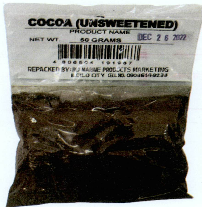
Figure 1. Unregistered RDM Cocoa (Unsweetened)

The Food and Drug Administration (FDA) warns all healthcare professionals and the general public NOT TO PURCHASE AND CONSUME the unregistered food product: