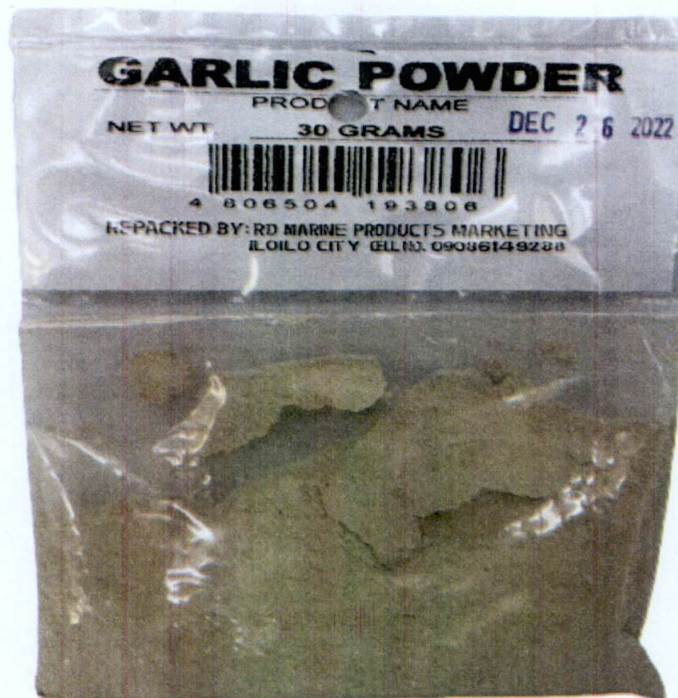
Figure 1. Unregistered RDM Garlic Powder

The Food and Drug Administration (FDA) warns all healthcare professionals and the general public NOT TO PURCHASE AND CONSUME the unregistered food product: