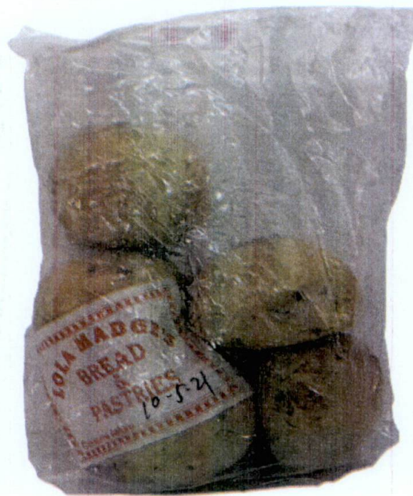
Figure 1. Unregistered LOLA MADGE'S BREAD & PASTRIES Stone Bread

The Food and Drug Administration (FDA) warns all healthcare professionals and the general public NOT TO PURCHASE AND CONSUME the unregistered food product: