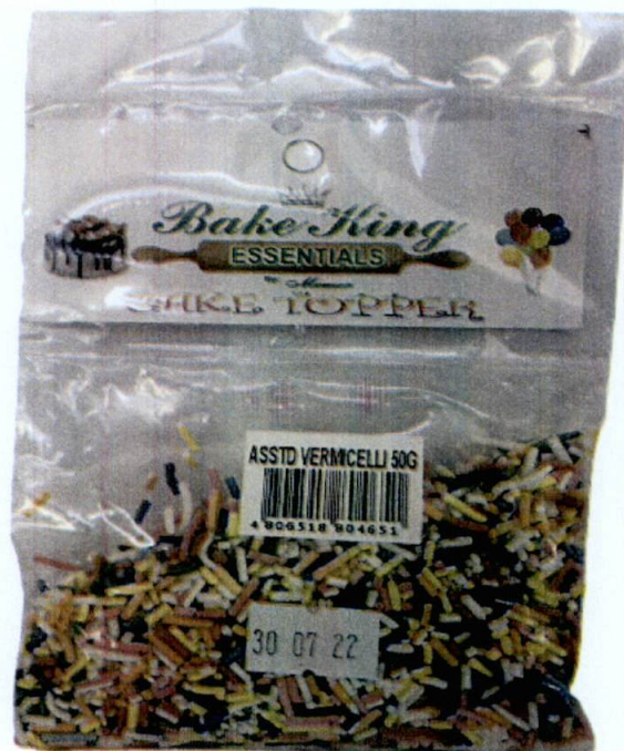
Figure 1. Unregistered BAKE KING ESSENTIALS Cake Topper Asstd Vermicelli

The Food and Drug Administration (FDA) warns all healthcare professionals and the general public NOT TO PURCHASE AND CONSUME the unregistered food product: