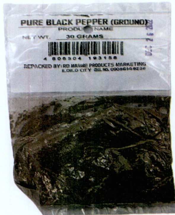
Figure 1. Unregistered RDM Pure Black Pepper (Ground)

The Food and Drug Administration (FDA) warns all healthcare professionals and the general public NOT TO PURCHASE AND CONSUME the unregistered food product: