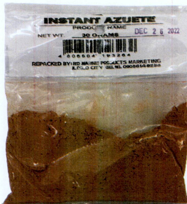
Figure 1. Unregistered RDM Instant Azuete

The Food and Drug Administration (FDA) warns all healthcare professionals and the general public NOT TO PURCHASE AND CONSUME the unregistered food product: