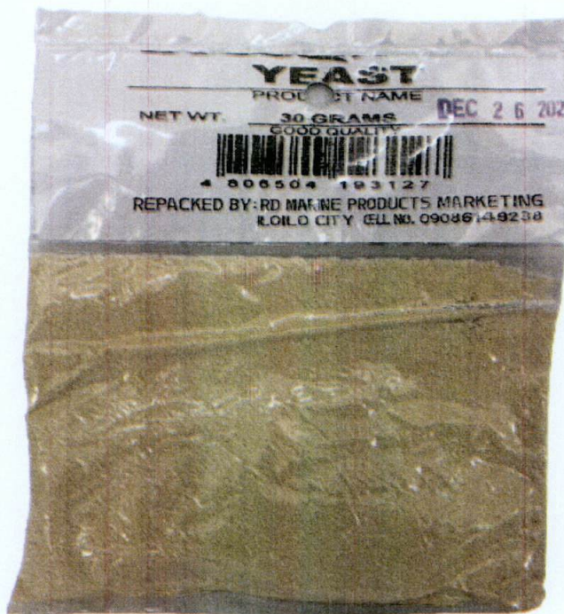
Figure 1. Unregistered RDM Yeast

The Food and Drug Administration (FDA) warns all healthcare professionals and the general public NOT TO PURCHASE AND CONSUME the unregistered food product: