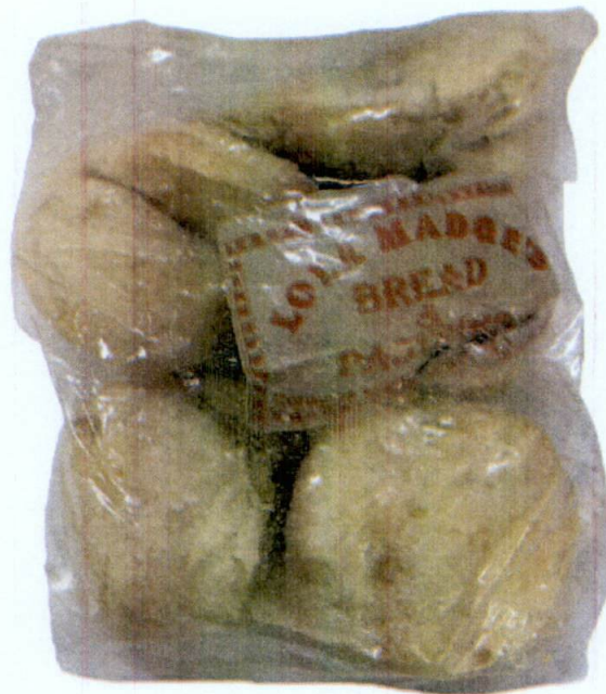
Figure 1. Unregistered LOLA MADGE'S BREAD & PASTRIES Hopia

The Food and Drug Administration (FDA) warns all healthcare professionals and the general public NOT TO PURCHASE AND CONSUME the unregistered food product: