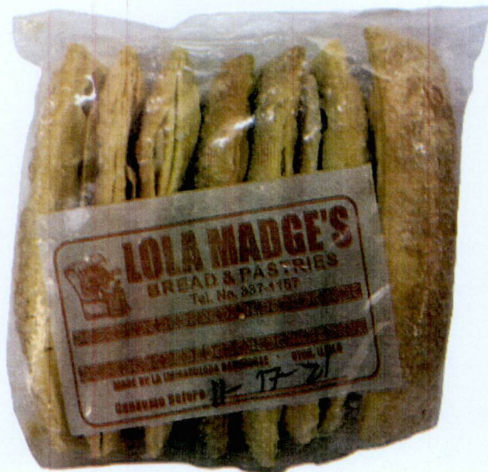
Figure 1. Unregistered LOLA MADGE'S BREAD & PASTRIES Ugoy-Ugoy

The Food and Drug Administration (FDA) warns all healthcare professionals and the general public NOT TO PURCHASE AND CONSUME the unregistered food product: