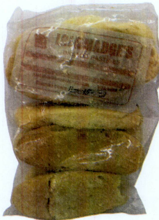
Figure 1. Unregistered LOLA MADGE'S BREAD & PASTRIES Biscocho

The Food and Drug Administration (FDA) warns all healthcare professionals and the general public NOT TO PURCHASE AND CONSUME the unregistered food product: