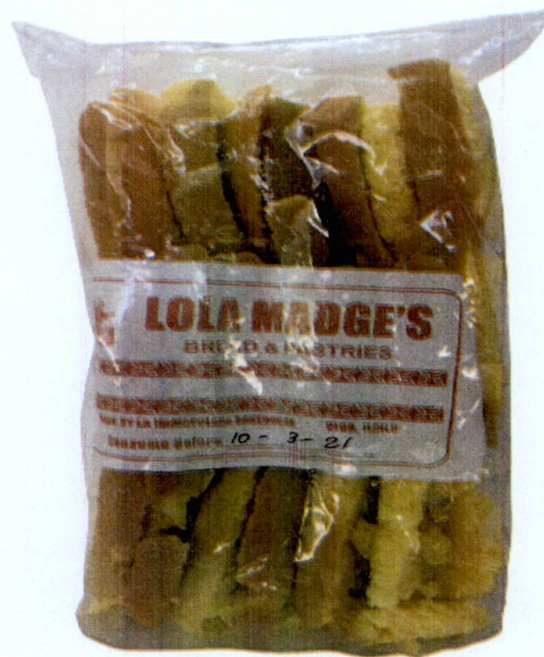
Figure 1. Unregistered LOLA MADGE'S BREAD & PASTRIES Kinihad

The Food and Drug Administration (FDA) warns all healthcare professionals and the general public NOT TO PURCHASE AND CONSUME the unregistered food product: