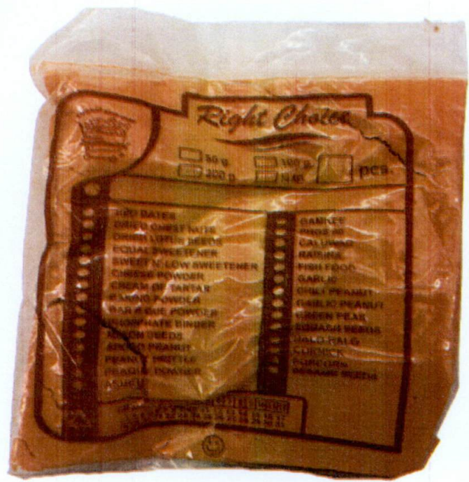
Figure 1. Unregistered RIGHT CHOICE Cheese Powder

The Food and Drug Administration (FDA) warns all healthcare professionals and the general public NOT TO PURCHASE AND CONSUME the unregistered food product: