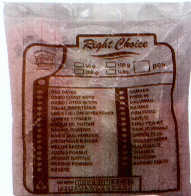
Figure 1. Unregistered RIGHT CHOICE Praque Pdr

The Food and Drug Administration (FDA) warns all healthcare professionals and the general public NOT TO PURCHASE AND CONSUME the unregistered food product: