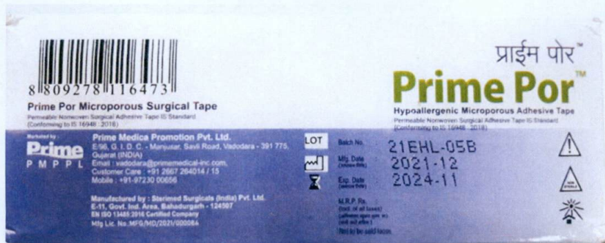
Figure 1. Unnotified Prime Por Hypoallergenic Microporous Adhesive Tape (2.50 cm x 9.1m)