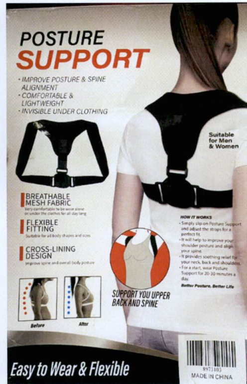
Figure 2. Unnotified Posture Support