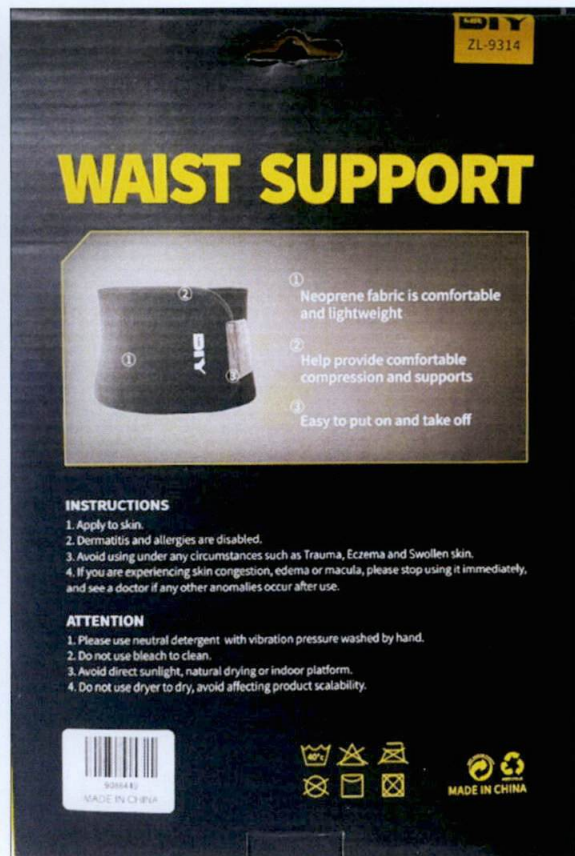
Figure 3. Unnotified Mr. DIY Waist Support