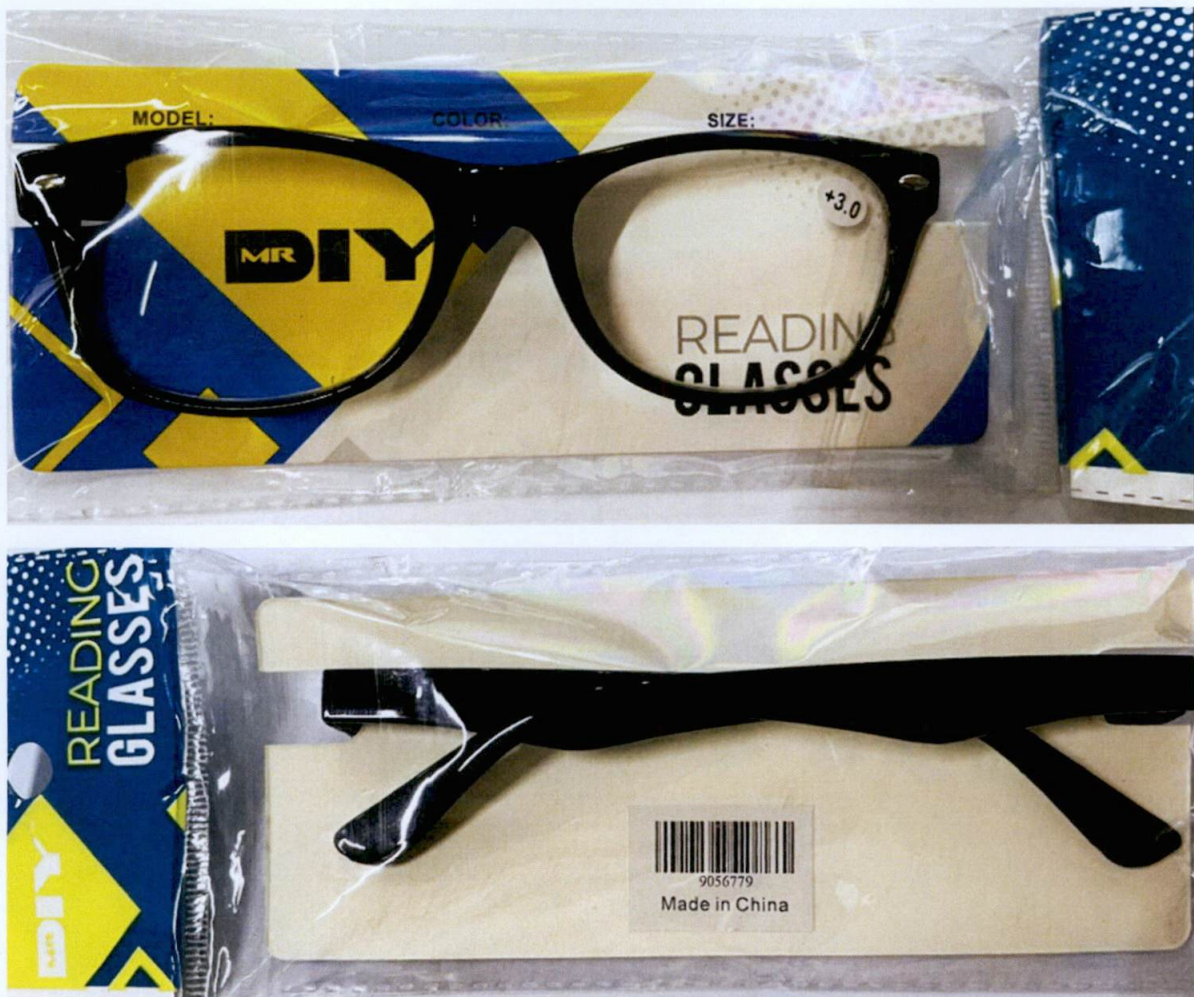
Figure 1. Unnotified Mr. DIY Reading Glasses

The Food and Drug Administration (FDA) warns all healthcare professionals and the general public NOT TO PURCHASE AND USE the unnotified medical device products: