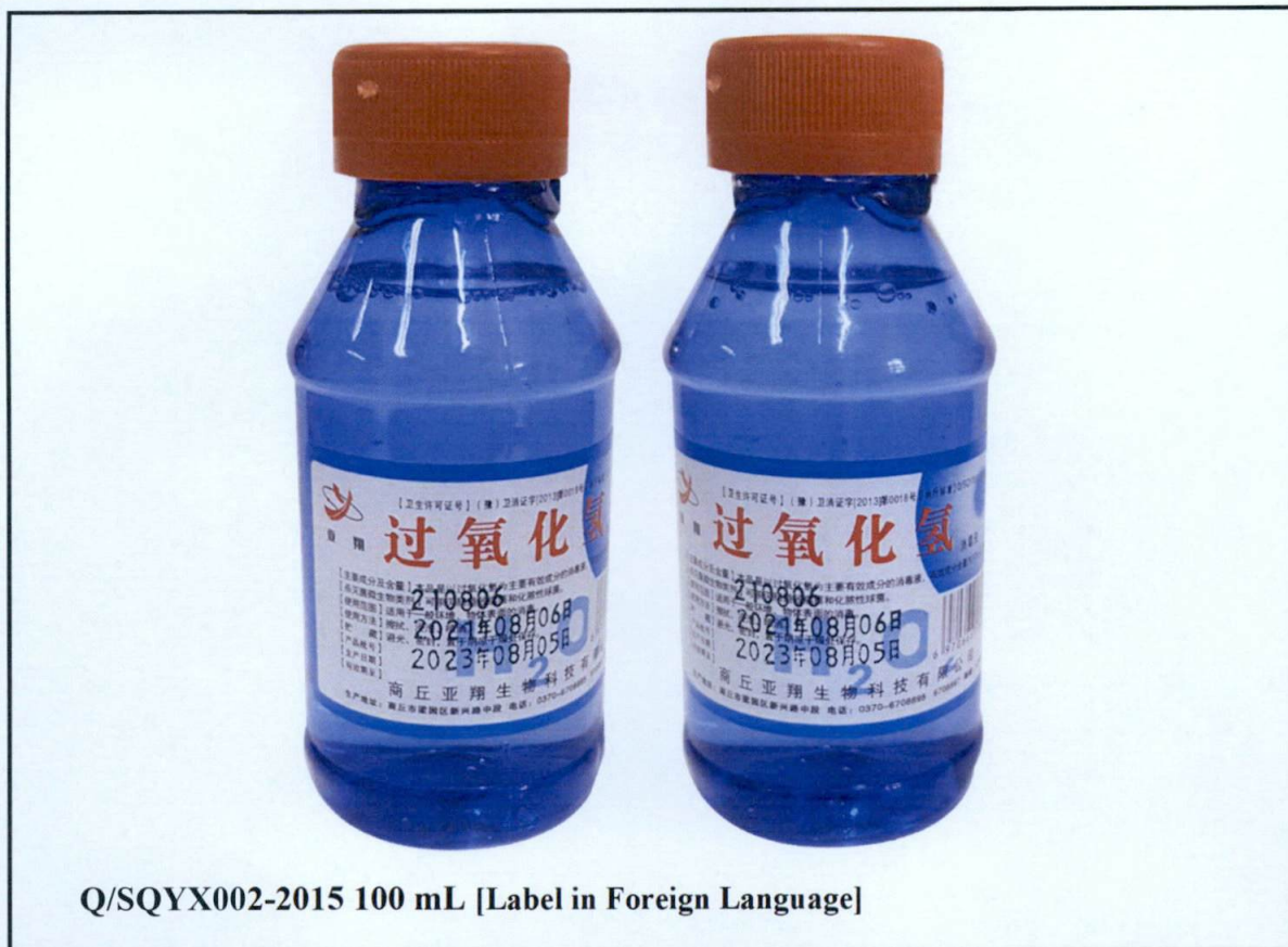
Q/SQYX002-2015 100 mL [Label in Foreign Language]