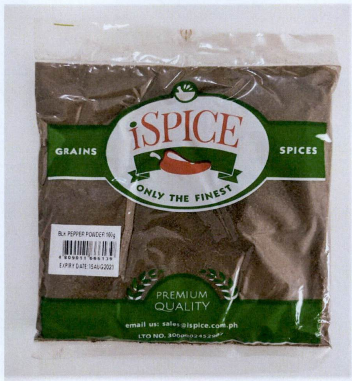
Figure 1. Unregistered iSPICE Black Pepper Powder

The Food and Drug Administration (FDA) warns all healthcare professionals and the general public NOT TO PURCHASE AND CONSUME the unregistered food product: