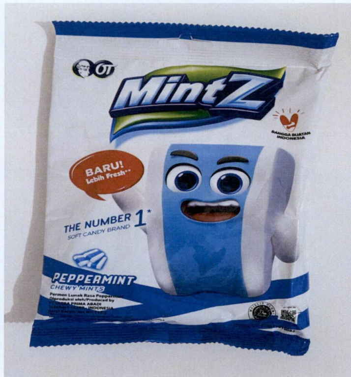
Figure 1. Unregistered OT MINTZ Peppermint Chewy Mints

The Food and Drug Administration (FDA) warns all healthcare professionals and the general public NOT TO PURCHASE AND CONSUME the unregistered food product: