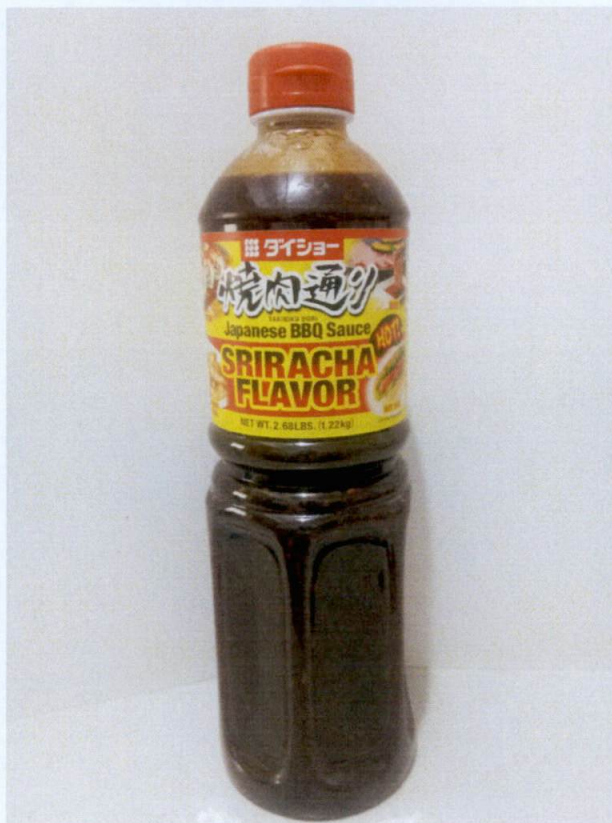
Figure 1. Unregistered YAKINIKU DORI Japanese BBQ Sauce Sriracha Flavor

The Food and Drug Administration (FDA) warns all healthcare professionals and the general public NOT TO PURCHASE AND CONSUME the unregistered food product: