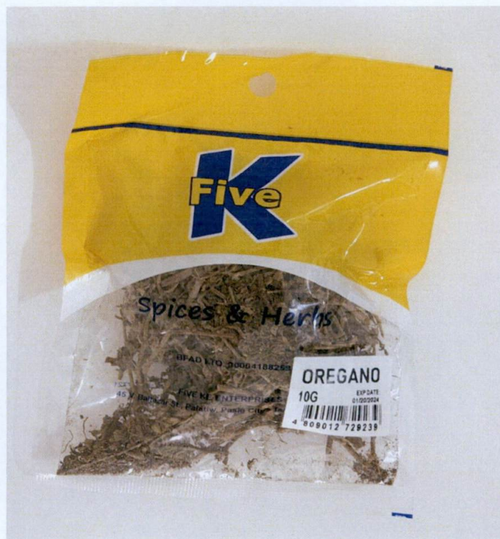
Figure 1. Unregistered FIVE K SPICES & HERBS Oregano

The Food and Drug Administration (FDA) warns all healthcare professionals and the general public NOT TO PURCHASE AND CONSUME the unregistered food product: