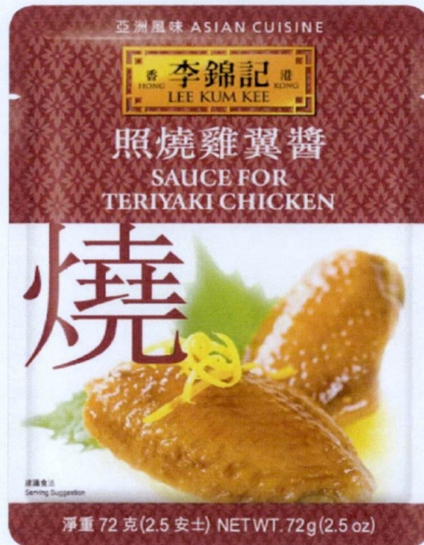
Figure 1. Unregistered LEE KUM KEE Sauce for Teriyaki Chicken

The Food and Drug Administration (FDA) warns all healthcare professionals and the general public NOT TO PURCHASE AND CONSUME the unregistered food product: