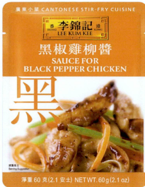
Figure 1. Unregistered LEE KUM KEE Sauce for Black Pepper Chicken

The Food and Drug Administration (FDA) warns all healthcare professionals and the general public NOT TO PURCHASE AND CONSUME the unregistered food product: