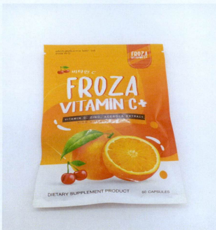
Figure 1. Unregistered FROZA Vitamin C+ Dietary Supplement

The Food and Drug Administration (FDA) warns all healthcare professionals and the general public NOT TO PURCHASE AND CONSUME the unregistered food supplement: