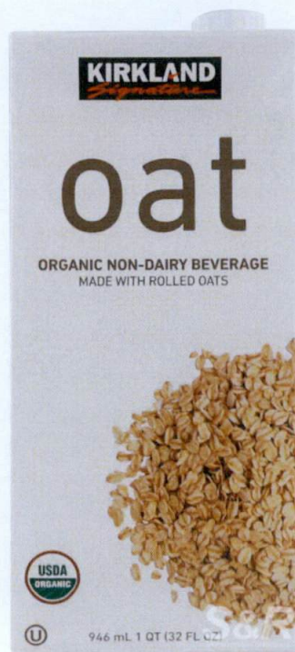
Figure 1. Unregistered KIRKLAND SIGNATURE Oat Organic Non-Dairy Beverage made with Rolled Oats

The Food and Drug Administration (FDA) warns all healthcare professionals and the general public NOT TO PURCHASE AND CONSUME the unregistered food product: